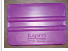
KAPCO PURPLE 4"- 1.15 each