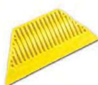
POWER STROKE YELLOW - SOFT 5.7" x 2.4" 8.75 ea.