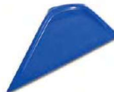
Little Foot Blue soft - 6.3"x 2.3" 4.75ea.

Little Foot fits comfortably in your hand and features an angled long-reach tip that gets behind gaskets and rubber seats quickly and easy. The pointed tip allows you to squeegee in tight places while keeping a firm grip.