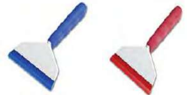
Replacement blades only for doctor series - red or blue 6.95 ea.

SMARTCARD Z PLATINUM FLEX FIRM - 5.3" WIDE. 7.50 Has a tapered tip, comfortable grip dynamic flex, and thin edge. With a "smart" grip-handle molded into the body, it is easy to hold and manipulate.