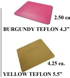
BURGUNDY TEFLON 4.3" 2.50 ea. YELLOW TEFLON 5.5" 4.25 ea.