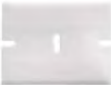
BIG BLADE PEARL 3" x 4" 3.25 ea.

The E.Z. Grips' Ergonomic design, allows for full blade pressure and contact to the substrate with less wrist strain for all-day use. The handles themselves are lightweight, they add rigidity to squeegee edges. End Caps and internal fins keep the non-used blade clean and secure. The E.Z. Grip is very useful when handling wide format media, eliminating lifting, and designed for easy squeegee blade replacement. Our handles fit 4" and 12" standard size squeegees.