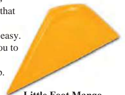
Little Foot Mango Firm- 6.3"x2.3" 4.75 ea.

Little Foot fits comfortably in your hand and features an angled long-reach tip that gets behind gaskets and rubber seats quickly and easy. The pointed tip allows you to squeegee in tight places while keeping a firm grip.