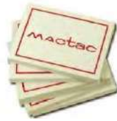
MACTAC FELT 4" - 5.35