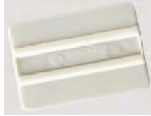
MACTAC WHITE 4" - 1.95 ea.