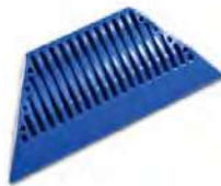
POWER STROKE BLUE - HARD 5.7" x 2.4" 8.75 ea.

Power Stroke is the original handheld molded squeegee, ergonomically designed to fit comfortably in your hand. It measures 5.7 inches from tip to tip, with a ridged grip area that fits your hand perfectly