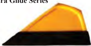
XGF LITTLE FOOT MANGO 6.3" x 2.4"-10.95