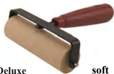
Deluxe model soft

4" Clear Acrylic Brayer Roller is interchangeable in a 1 piece sturdy plastic frame. Will not pick up wax or rubber cement during use.