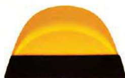
XGF SMART CARD MANGO 5"x3" - 10.95

Ergonomically designed to fit comfortably in your hand, reducing installer fatigue, the Xtreme Glide Felt series can be used for various applications including vinyl graphics, decals, signs, & vehicle wraps. The series involves a treatment option consisting of a prime quality, long lasting felt edge that minimizes scratches, delivering a flawless finish. All products in this line up have a very high slip rating, which allows for smooth installations.