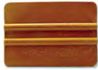
3M GOLD 4" 4.75 ea. 3M BLUE 4" 1.70 ea.