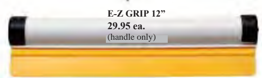
E-Z GRIP 12" 29.95 ea. (handle only)

can be used with our wide format squeegees