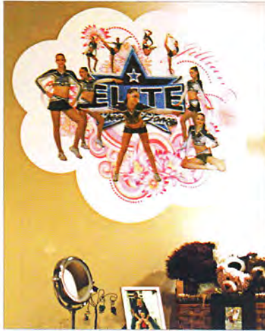
Application: Wall Graphics Material: wallNOODLE ™