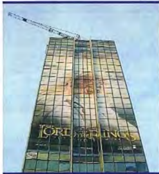
Application: Outdoor Signage Material: IMAGin JT5829P