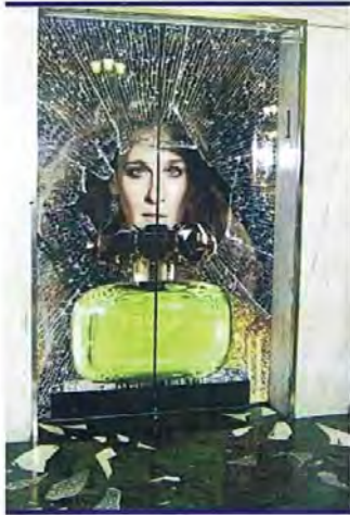
Application: Indoor Advertising Material: IMAGin 5828R