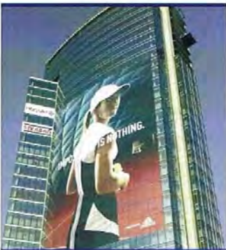
Application: Outdoor Signage Material: IMAGin® JT5829R

JT5800 Series is part of the Viacom endorsed offerings for outdoor advertising.