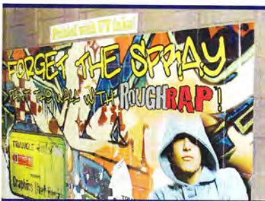
Application: Wall Graphics Material: IMAGin® Digital Media for Wall Wraps