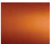
smooth mirror copper

Width 24" PRICES per yd. 1-9yds. 26.95 yd. 10 yds. 22.85 yd. 50 yds. 19.85 yd.