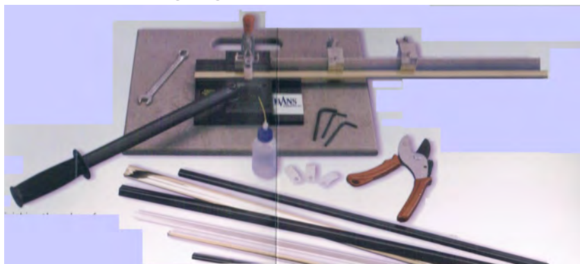
Image Edge Lineals