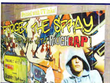
Application: Wall Graphics Material: IMAGin® Digital Media for Wall Wraps