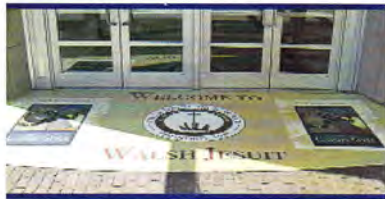
Application: Concrete Graphic Material: StreetRap