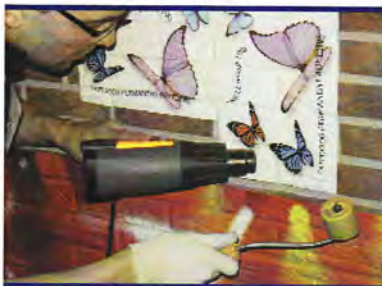
Application: Wall Graphics Material: IMAGin® Digital Media for Wall Wraps