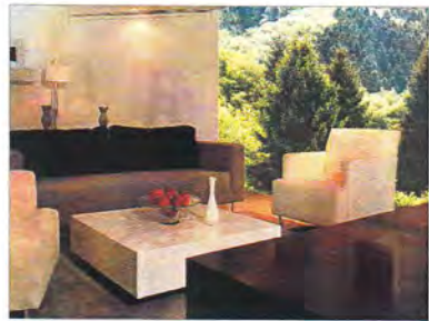
Application: Wall Graphics Material: ROODLE ™