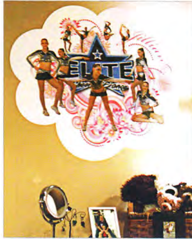
Application: Wall Graphics Material: wallNOODLE ™