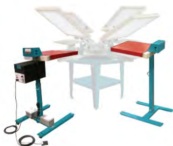
Hot-Flash AUTOTURN™ (Optional, Automatic head turning kit)