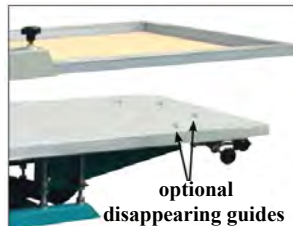
optional disappearing guides

Note: Prices are in U.S. $ plus freight from Chicago, IL.